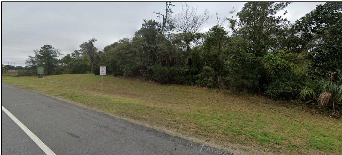
Park (March 2021)