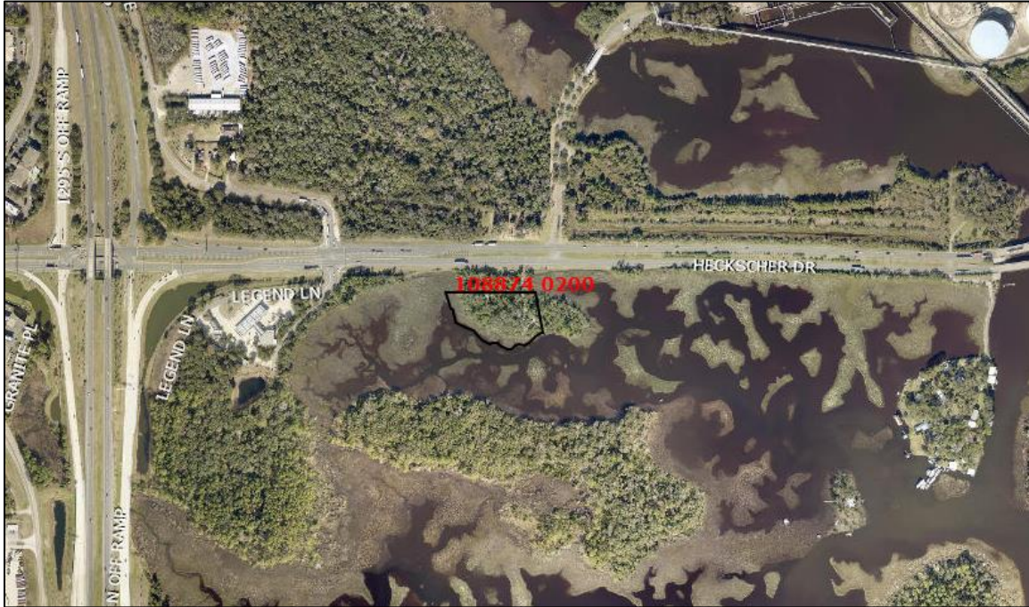
Aerial view of park

Based on the best evidence available, the Jacksonville Historic Preservation Commission recommends approval of the proposed naming of “Seiden Park.” Variations on the name were also approved. These include “The Seiden Family Park” and “Seiden Family Park.”