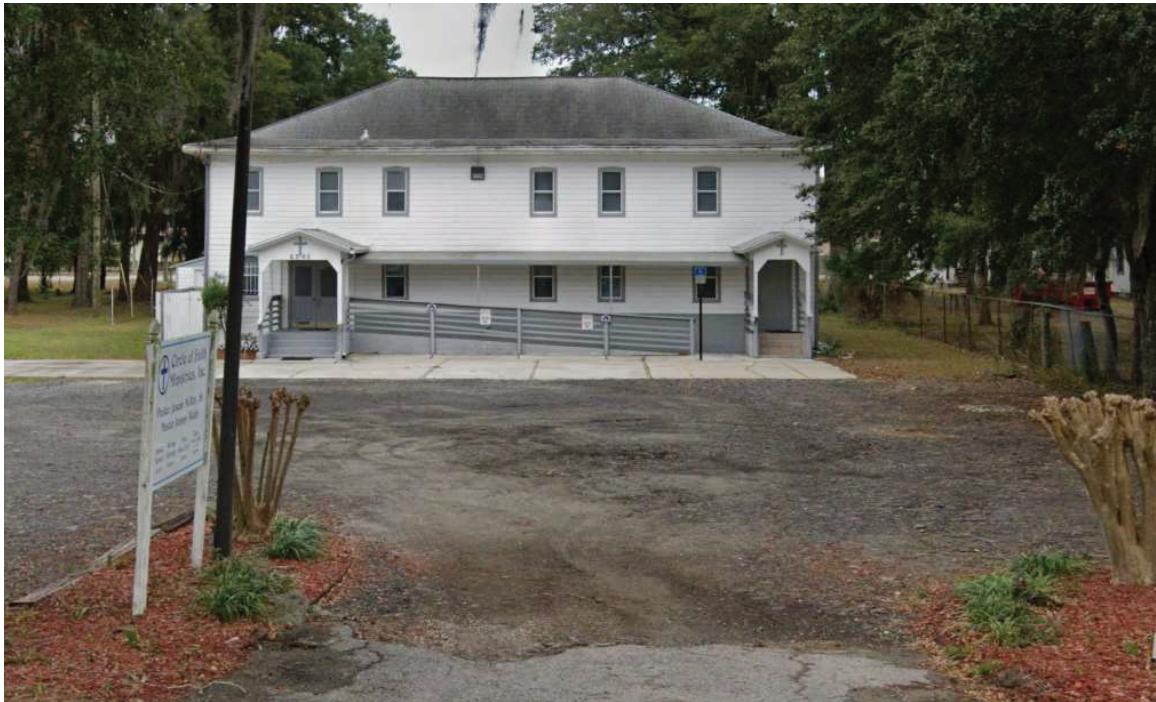
View of the Building's Main Entrance