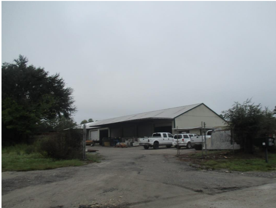
View of the existing business to the south.