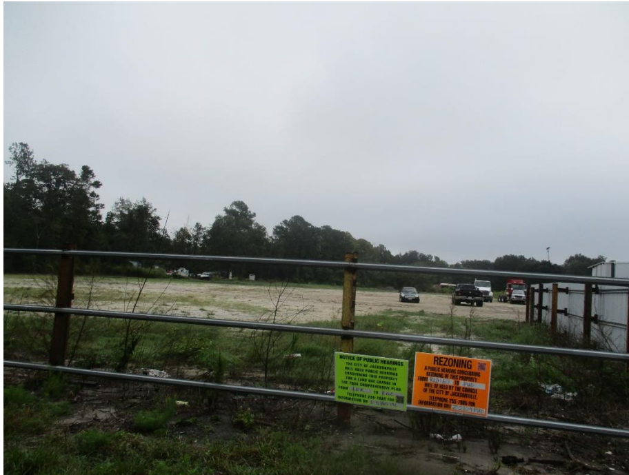
View of the Subject Property