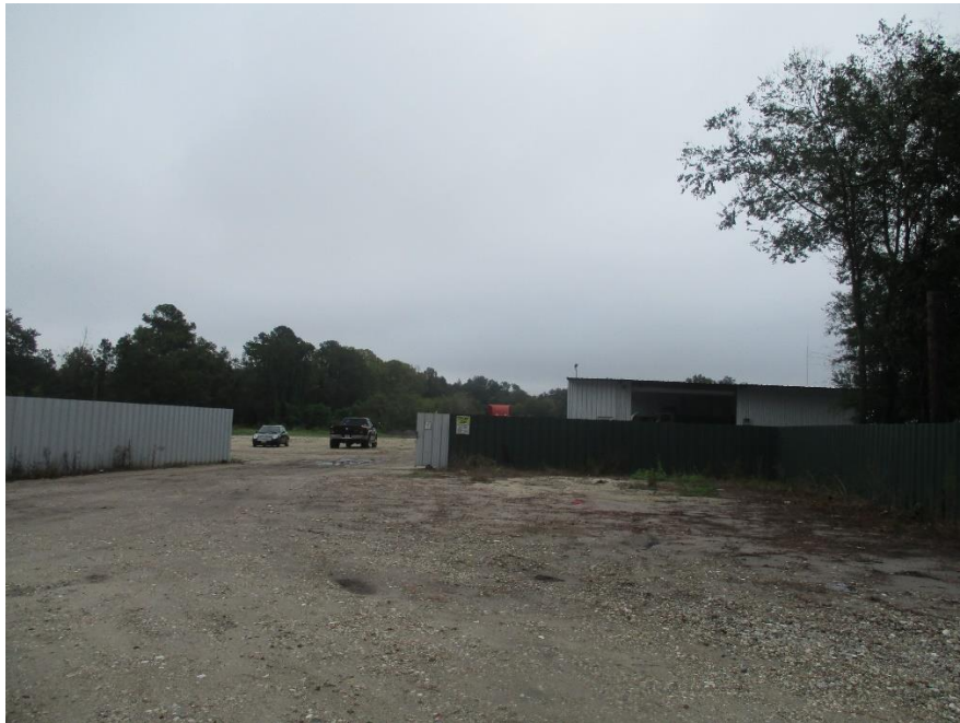
View of the shared driveway between the existing building and the proposed lot.