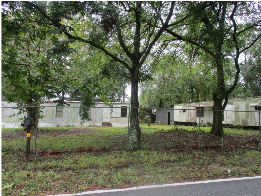
View of the residential property to the west of the subject property across Cahoon Road.