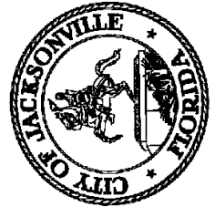
Exhibit 2 (Page 1 of 1)