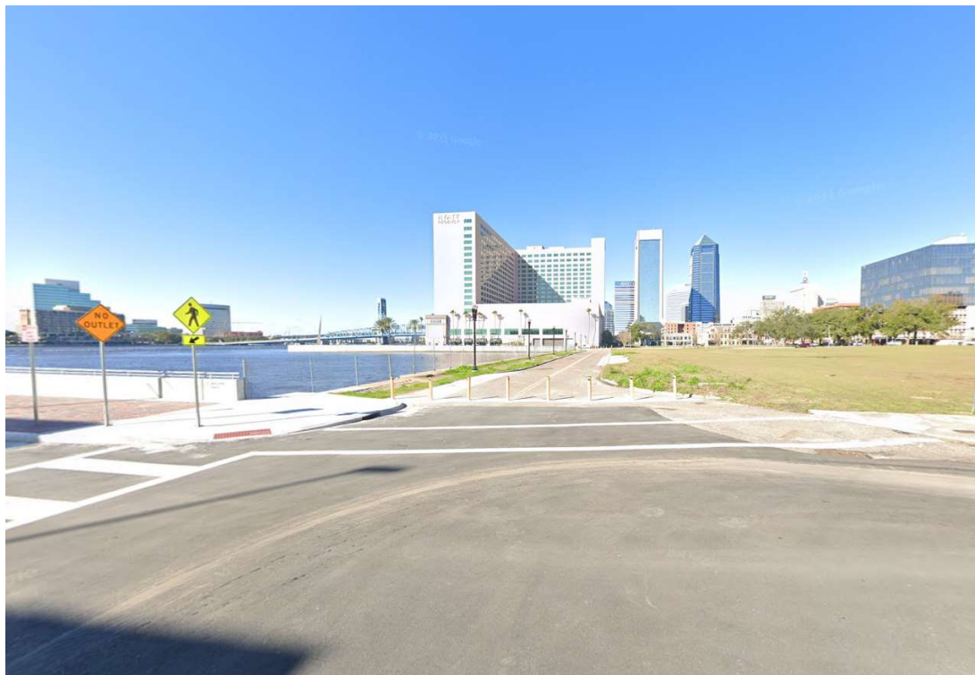
View of the Subject Property, Facing West on South Liberty Street