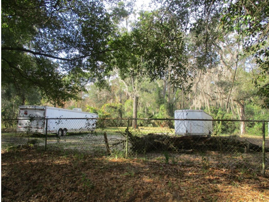
View of the Subject Property.

Date: January 24, 2020