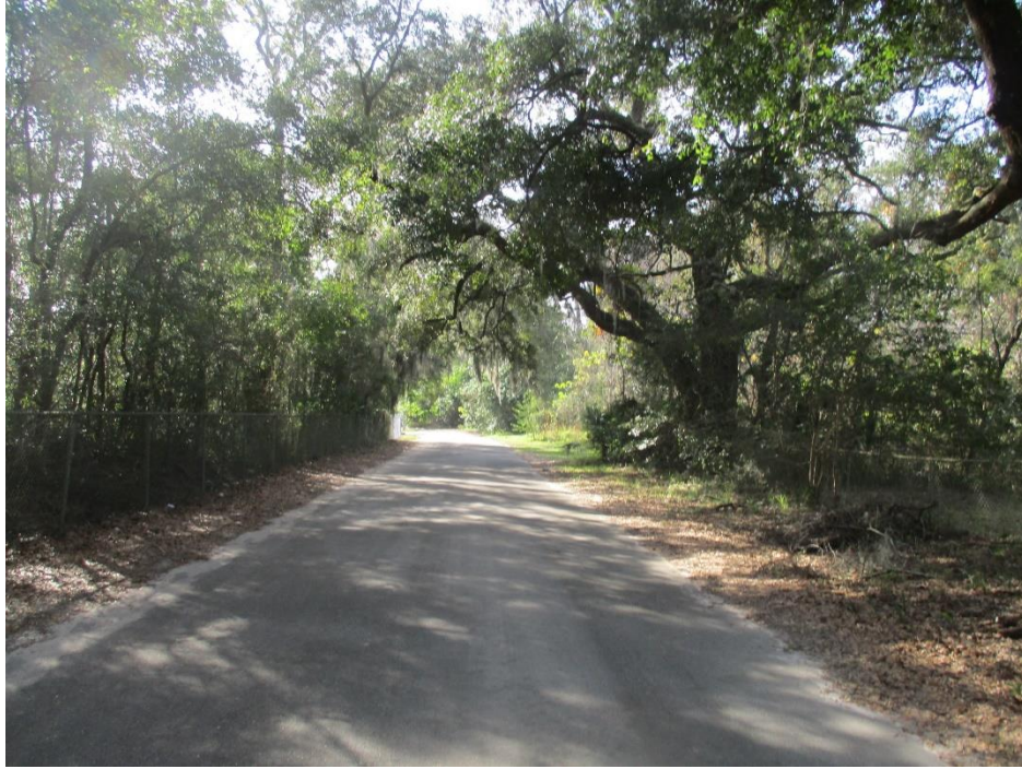
View looking south along Stetson Road.

Date: January 24, 2020