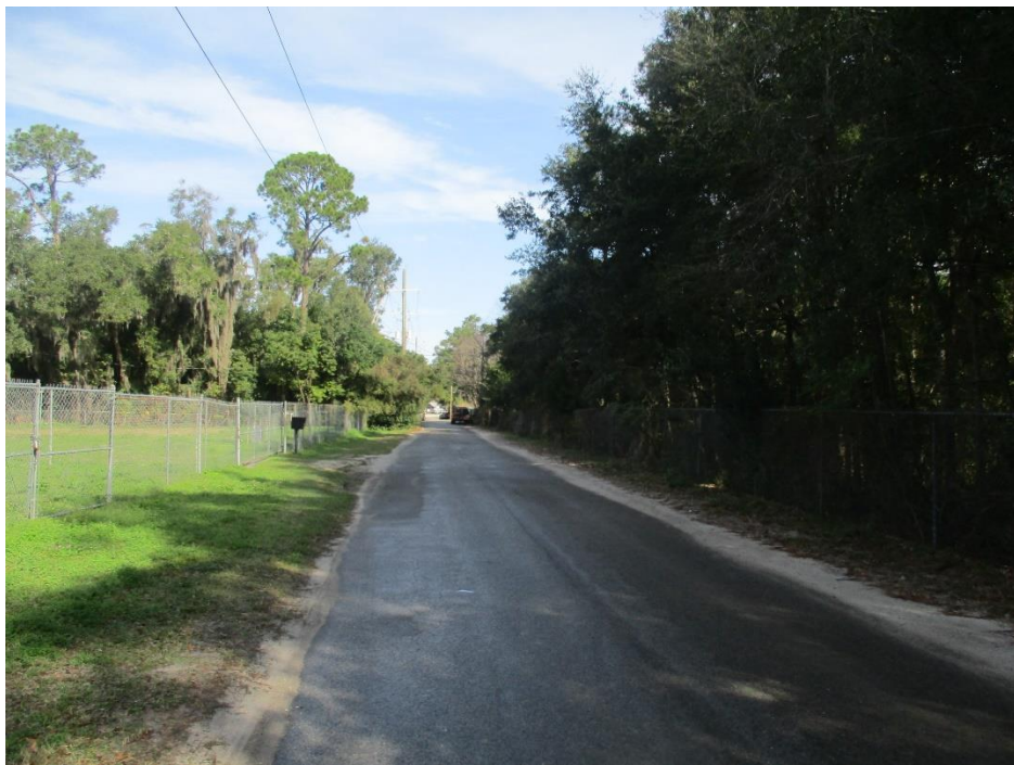
View looking north along Stetson Road.

Date: January 24, 2020