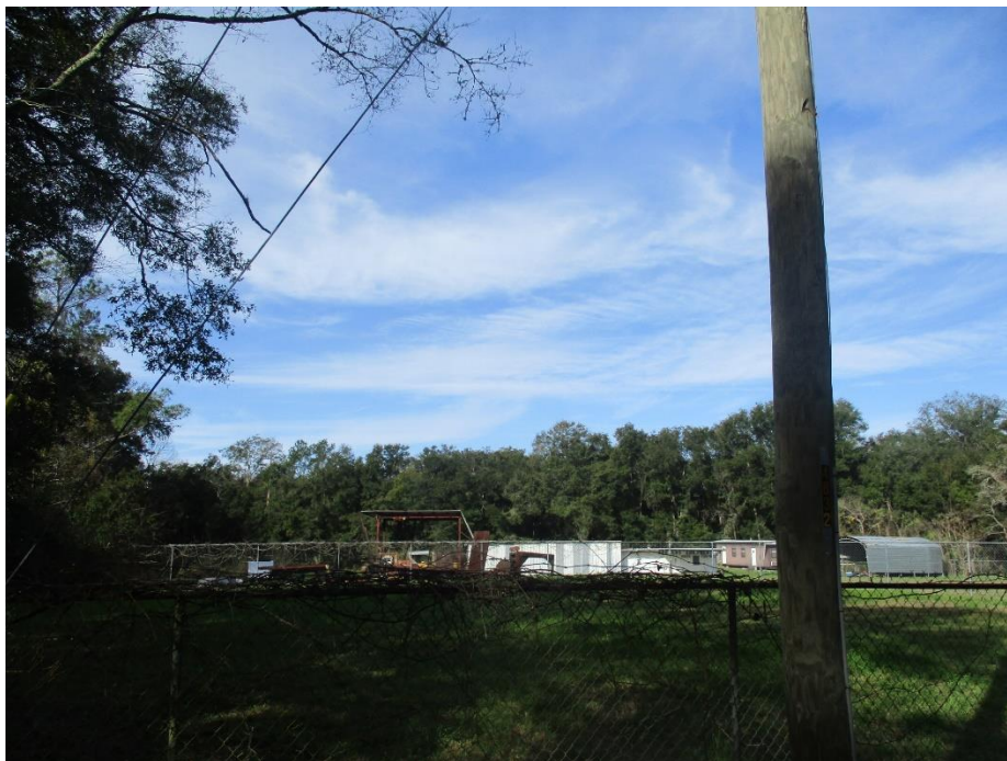
View of the neighboring industrial parcel to the north.

Date: January 24, 2020