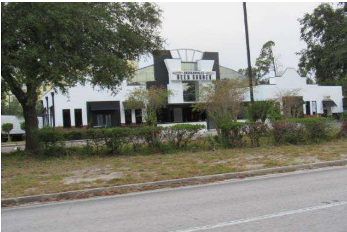
View of subject property