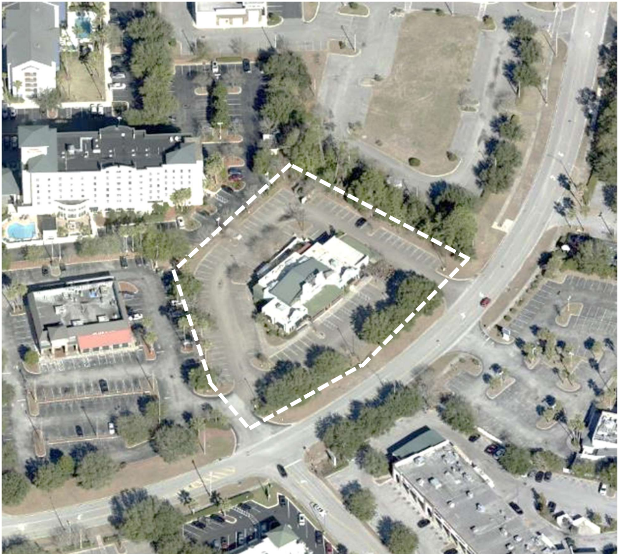
Aerial View of Subject Property.