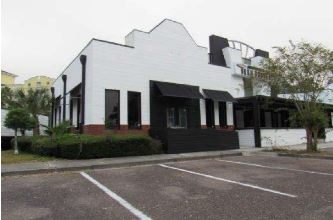
View of subject property