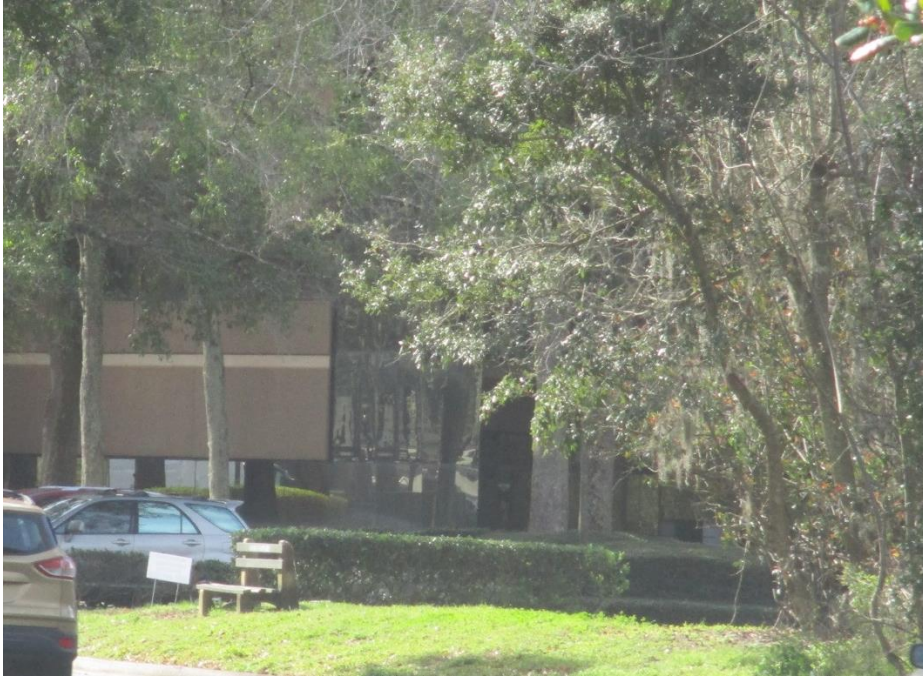
View of the office building to the south of the subject site.