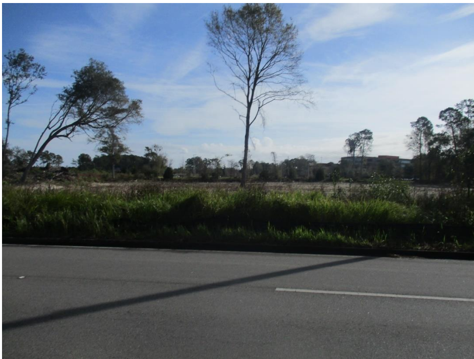
View of the neighboring parcel across Baymeadows Way.

Date: January 24, 2020