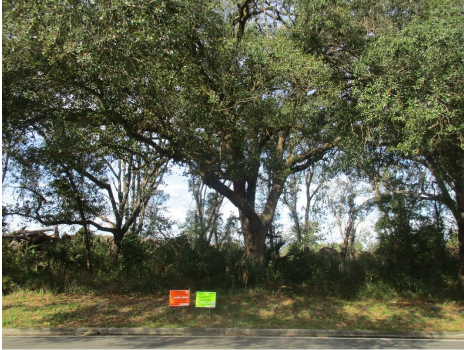
View of the Subject Property.

Date: January 24, 2020