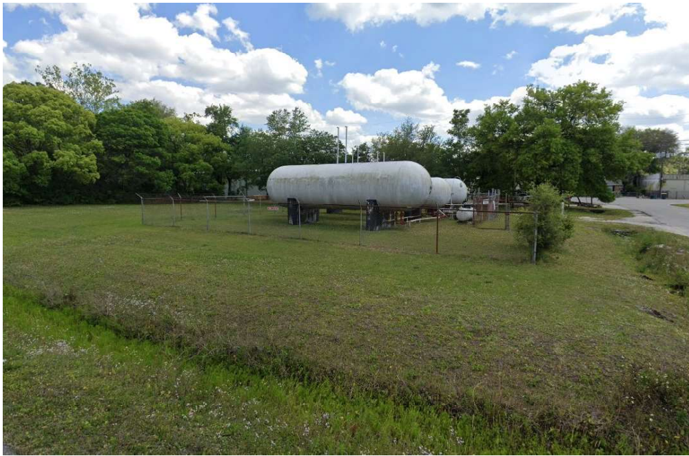
View of the Subject Site